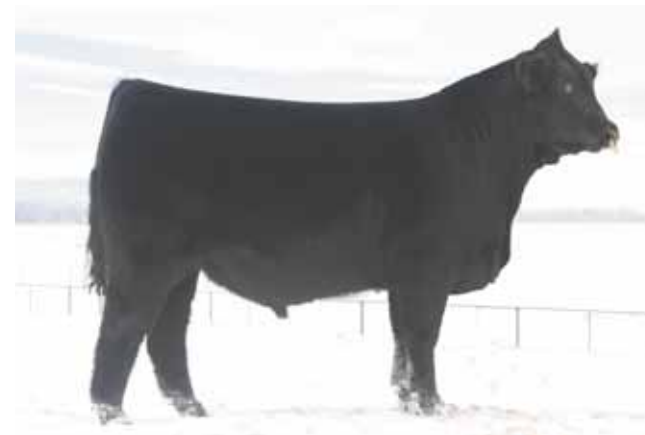
Sire, MAGS Xyloid

P.E. 12.04.2019 to 3.23.2020 to ELCX Caesar 331C (56% P/HB) ELCX Extra 90E is a MAGS Xyloid daughter that deserves your at- tention. She is double black and double polled. We love MAGS Xyloid daughters for their maternal instinct and ability to produce high end offspring with power and efficiency. Don't look past this beautiful female on sale day!