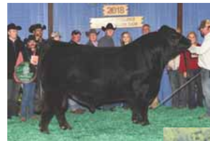
Sire, ELCX Kings Landing

ELCX Fresh Queen 856F is a female that will be at the top of everyone's short list for sale day. She is a double homozygous daughter of the great ELCX Kings Landing and the leading donor, SBLX Unknown. Unknown is the daughter of MYTTY In Focus and from the great MAGS Manuela female. She is a 65% Lim-Flex female that will generate individuals full of power, design and functionality.