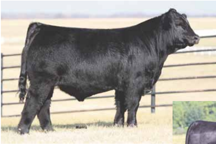
Sire of Lots 26, 27 & 28, AUTO Direct Drive 107D