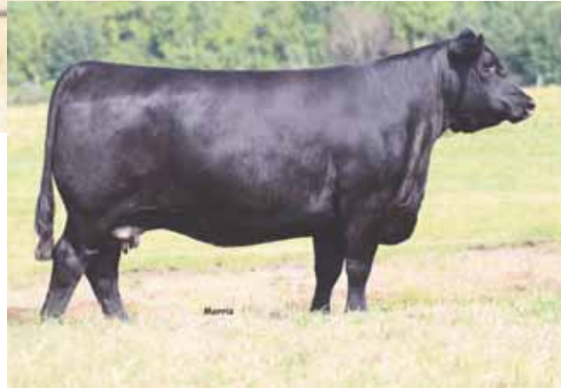
Dam of Lot 26, SBLX Unknown 104U

Lim-Flex (68) Cow Polled / HB ELCX 819F LFF 2158229 05.01.18