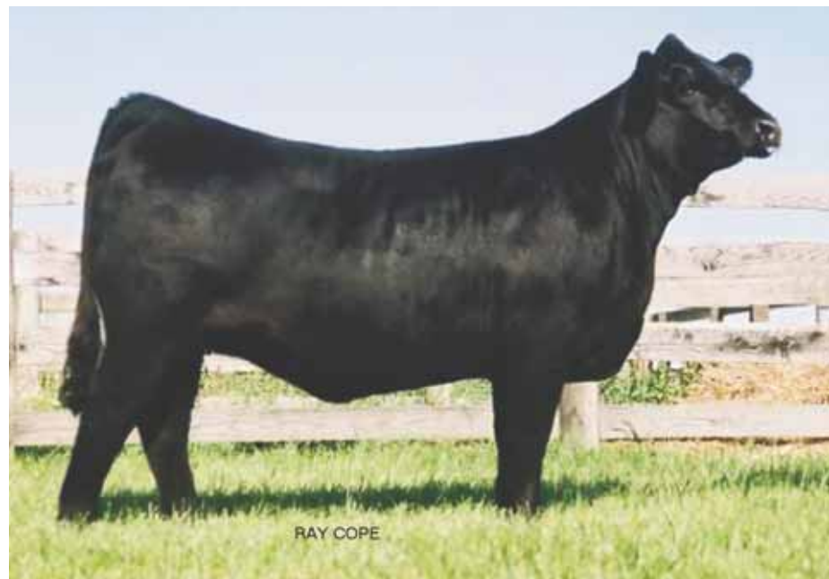
Dam of lots 35 - 37, AUTO Christy 8889R

Doesn't everyone love a 'fun size'? Well, ELCX Fun Size 840F is all that and so much more. She is a 75% Lim-Flex female out of JCL Lodestar. Her dam, AUTO Christy 8889R is a daughter of EXAR New Design 3903. She is homozygous black and homozygous polled.