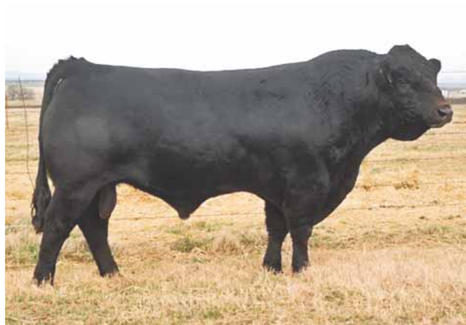
Sire of lots 36 & 37, JCL Lodestar 27L

ELCX Future Star 845F ET is a 75%-Flex female out of the legendary JCL Lodestar. Her dam is the EXAR New Design daughter, AUTO Christy 8889R. She is homozygous black and heterozygous polled. ELCX Future Star 845F is a full sibling to ELCX Fun Size 840F, so don't miss this phenomenal opportunity!