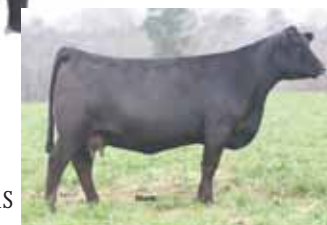
Dam, DFLC HBHPC 1S