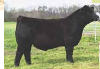
ELCX Gone Fishin 929G