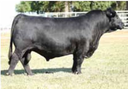
PBRS Bunk House 48B