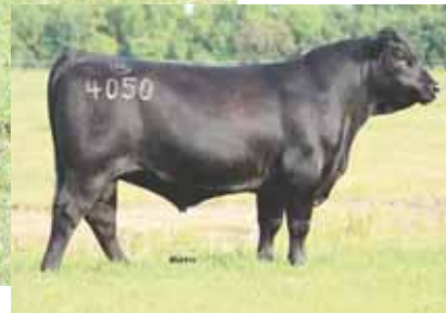
Sire, Woodside Rito 4050 of 0M3

ELCX Ember 142E is a double polled and double black daughter of Woodside Rito 4050 of 0M3. Her dam is a MAGS Xyloid daughter. This female's marbling EPD ranks at the very top of the entire breed. She is about as long topped as you can make a female. She's upheaded, beautiful in her lines and built to last from the ground up. We love her powerful hip and the amount of rib shape this female has. A solid breeding decision that will impact the future of your operation!