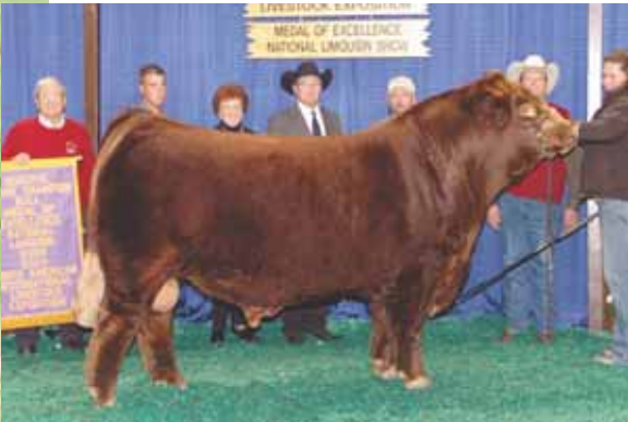
Sire, MAGS WLR Usual Suspect