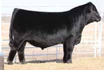
MAGS Firestone 218F