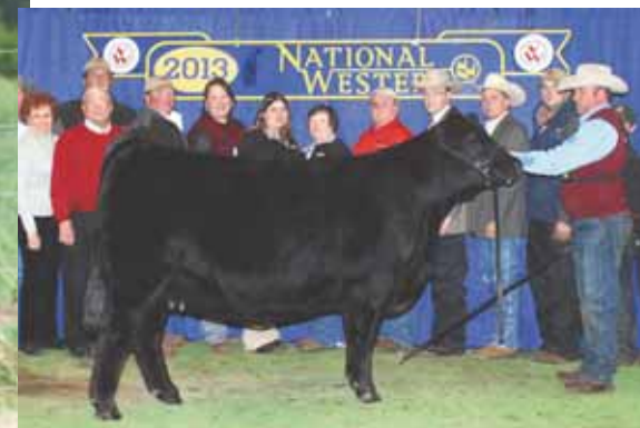
Dam, National Champion, ELCX Twilight 114X