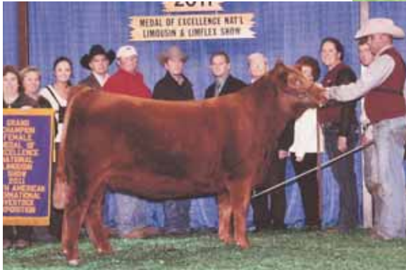
Dam, WLR Tainted Love 746X