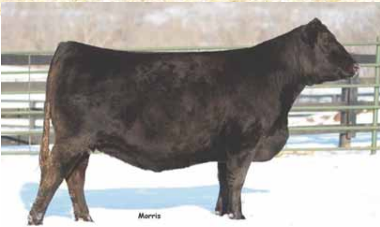
Sire of Lots 23 - 25, Riverstone Crown Royal