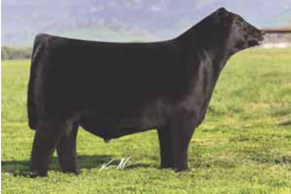
Sire, Colburn Primo 5153