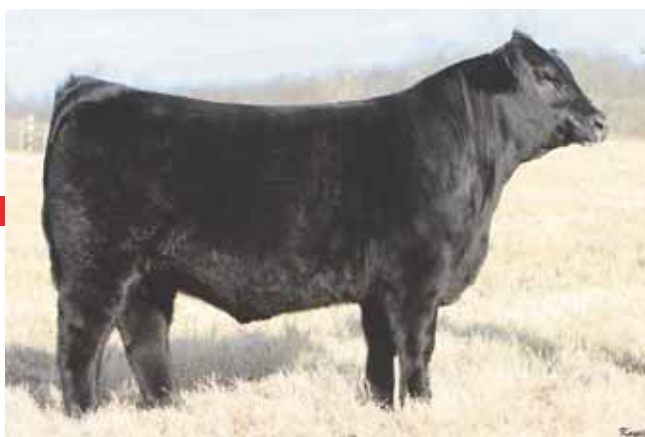
Sire, AGRI Chairman 1C ET

RLBH AIR FORCE ONE EF XCESSIVE FORCE ELCX CAESAR 331 C EF YAFFA 821Y PBRS ALICE 331A MAGS YIP BUFORD LUCY 930Z MYTTY IN FOCUS S A F FOCUS OF E R SBLX UNKNOWN 104U MYTTY COUNTESS 906 MAGS MANUELA EXLR LIMITED EDITION 765J AUTO CITY NIGHTS 214H