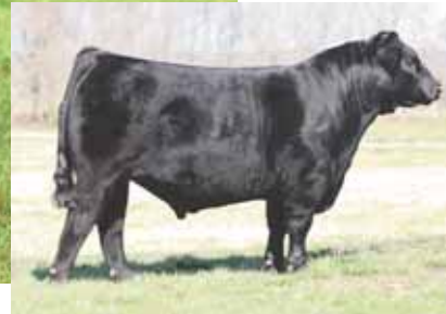
Sire, AUTO Real Deal 150B

ELCX Good N Gone is an AUTO Real Deal daughter out of the great ELCX Charmer female. ELCX Charmer is the MAGS Xyloid and WLR Prada daughter that continues to produce some of the most solid breeding pieces. We love this gal's elite look and design. She has a big, powerful hip, a capacious center body and a beautiful front one third. We believe in this female's ability to continue in her elite pedigree's footsteps of generating high performing, functional and stylish individuals. This female is homozygous black and homozygous polled. Her weaning weight and yearling weight EPDs both rank in the top 2% of the entire breed.