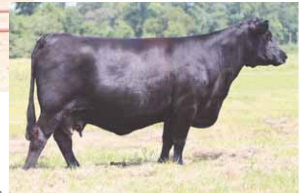
Dam of Lot 33 & 34, DFCL HBPC 25L,