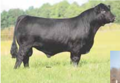
HWCB Eye of the Storm