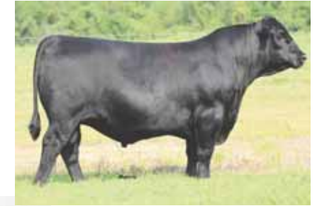
ELCX Benchwarmer 363B

Lim-Flex (50) Bull Polled / Black ELCX 929G LFM 2173151 05.02.19