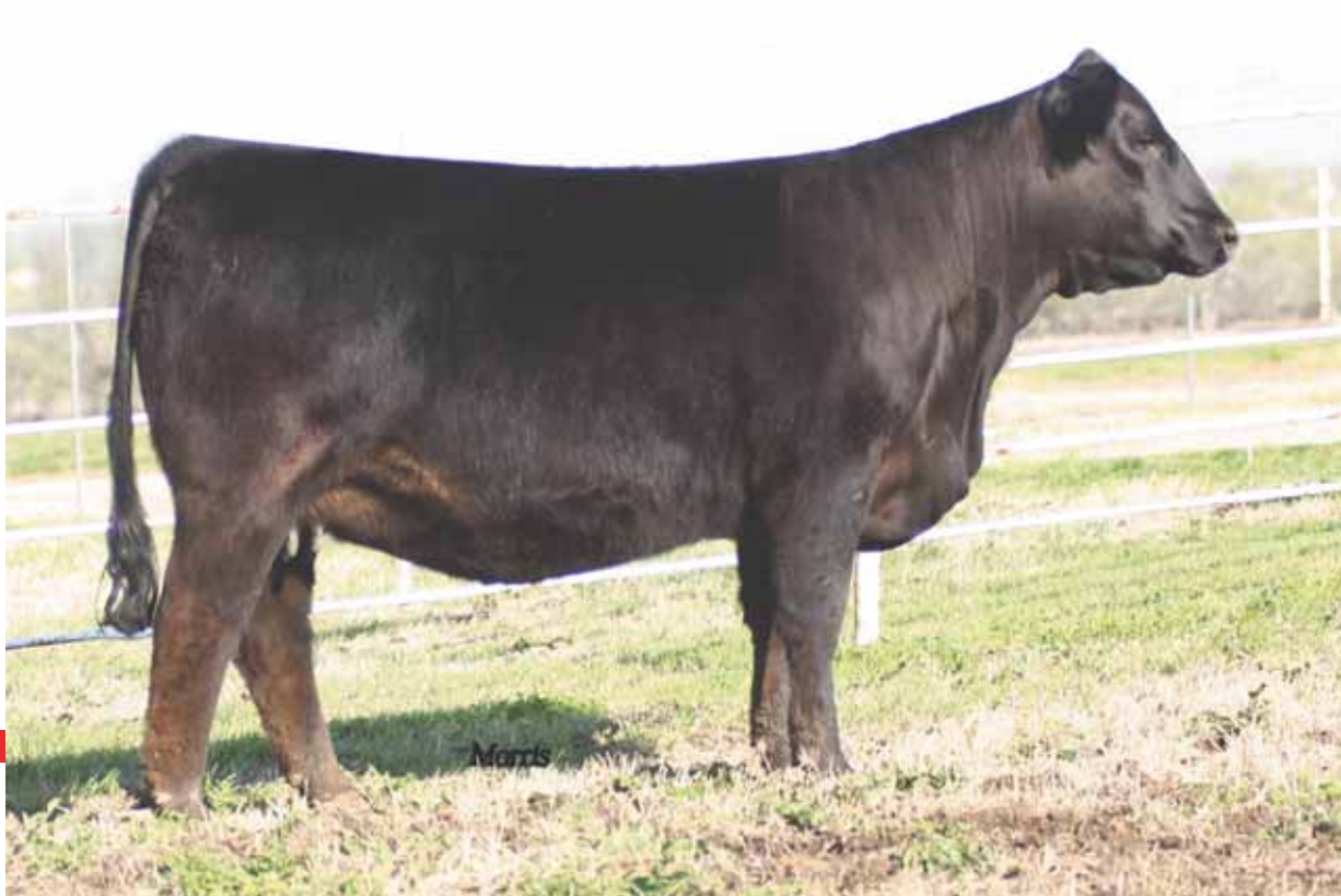
Grandam of Lot 31, ELCX Underthecover 201U