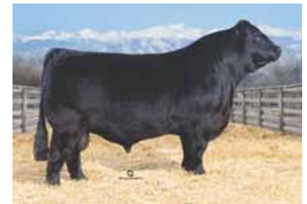
ELCX Kings Landing 599D

Lim-Flex (75) Bull Polled / HB HWCB 406E LFM 2117062 03.17.17