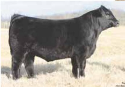
AGRI Chairman 1C ET