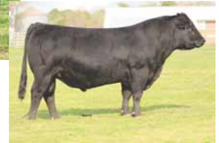
ELCX Caesar 331C