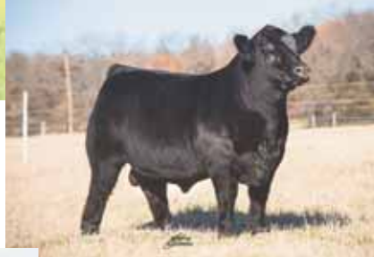
SSTO Best Bet 456B