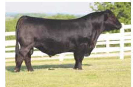
ELCX Bullet Proof 438B

Lim-Flex (56) Bull HP / HB MAGS 218F LFM 2138718 02.04.18