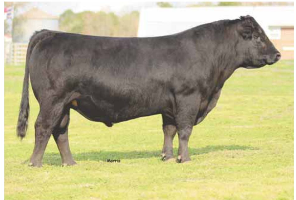
Sire of lots 42 - 44, ELCX Caesar 331 C

ELCX Fool Proof 301F is a tremendous ELCX Bullet Proof female that will blow your mind with her number profile. Her marbling EPD ranks in the top 4% of the breed, her milk EPD ranks in the top 10% and her weaning weight EPD is in the top 15%. She is a 25% Lim-Flex female that is homozygous black and homozygous polled.