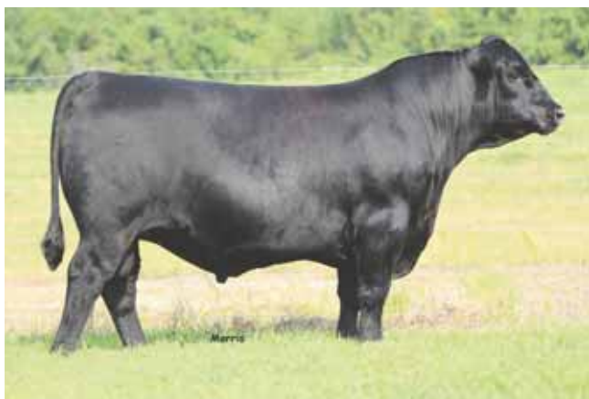
Sire, Benchwarmer 363B

P.E. 1.03.2020 to 4.04.2020 to ELCX Fully Royal 451F (75% DP/HB)