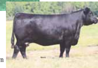
Dam, SBLX Unknown

Limousin (12.5) Cow HP / DB ELCX 798F -- 11.03.18