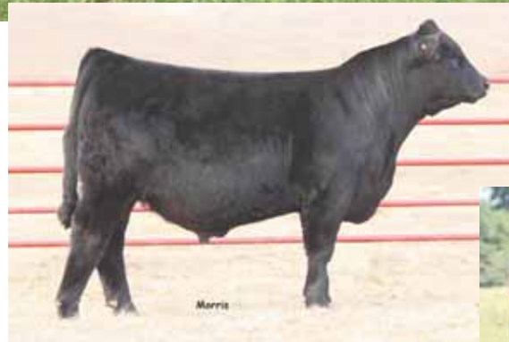
Sire, LVLS Bank Account 8116B