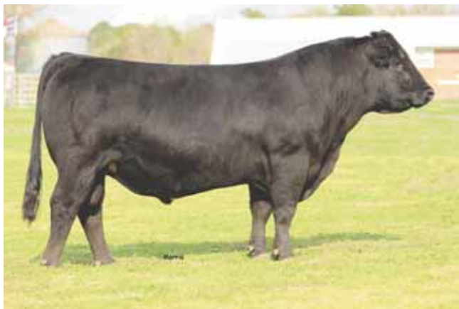
Sire, ELCX Caesar 331C

P.E. 1.03.2020 to 4.04.2020 to ELCX Fully Royal 451F (75% DP/HB)