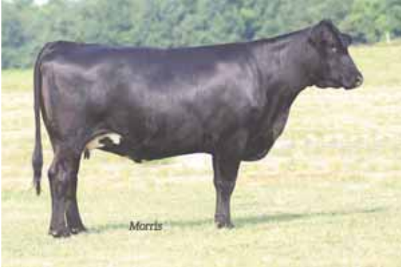
Dam, MAGS Xanthopsias