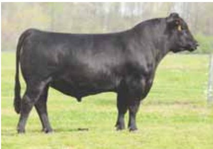
ELC Twisted Ex C561

Lim-Flex (43) Bull Polled / HB SSTO 456B LFM 2077532 10.03.14