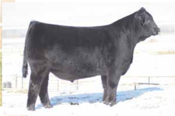
Full sib, MAGS Aviator