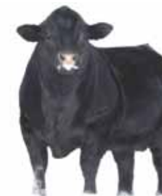
Sire, TMCK Durham Wheat 6030X

ELCX First 842F is a TMCK Durham Wheat female that deserves your full attention. This female's dam, DFLC 1S is a JCL Lodestar daughter. Her marbling EPD ranks in the top 15% of the breed and her birthweight ranks in the top 20%. This 87% Limousin female is full of opportunity. With time trusted genetics so deep in her pedigree, you can be confident in her producing ability. She is homozygous black and heterozygous polled.