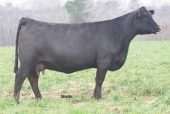
Dam, DFCL HBHPC 16S