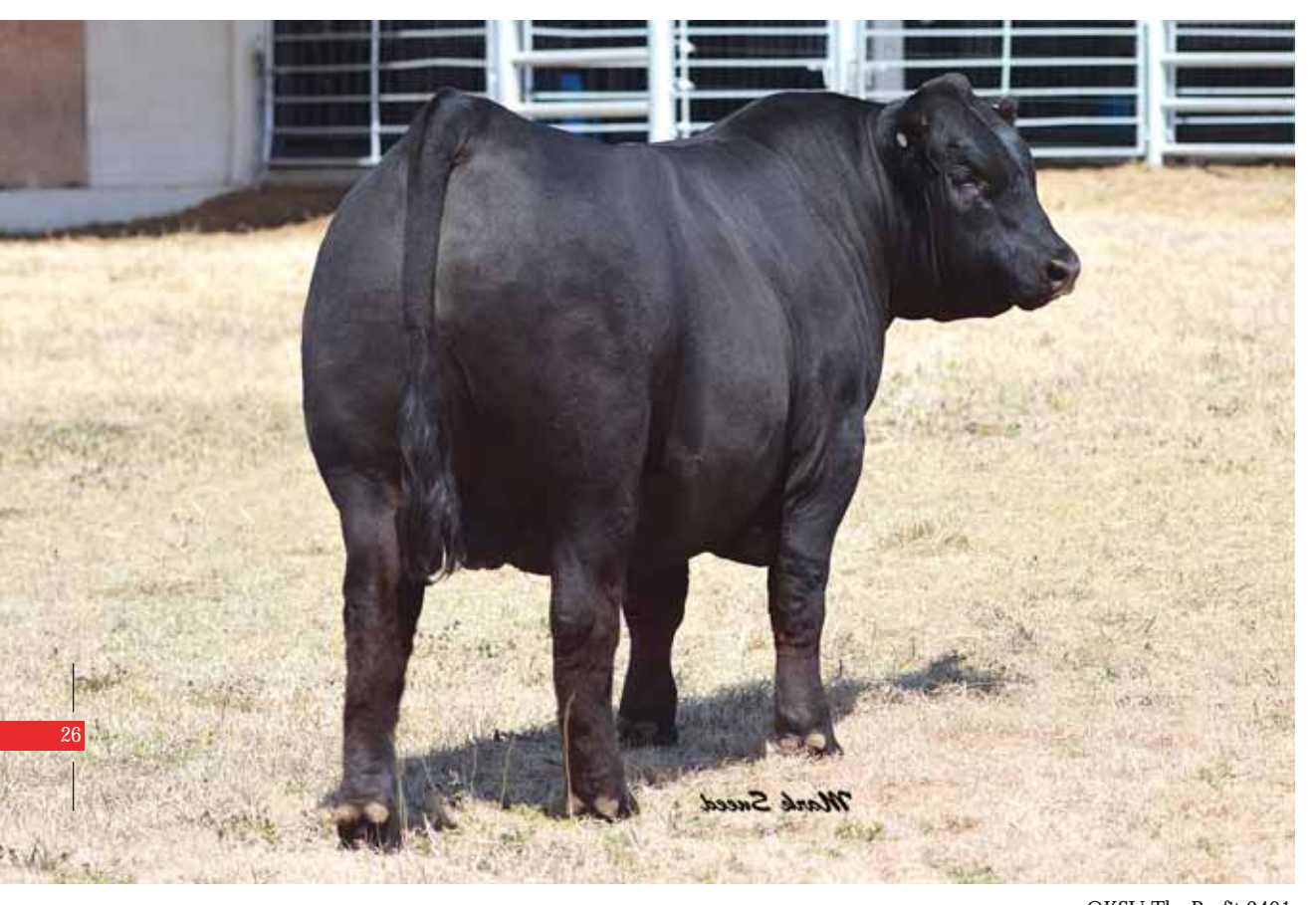
OKSU The Profit 3401