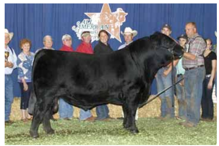
WLR Reload, service sire to Lot 28