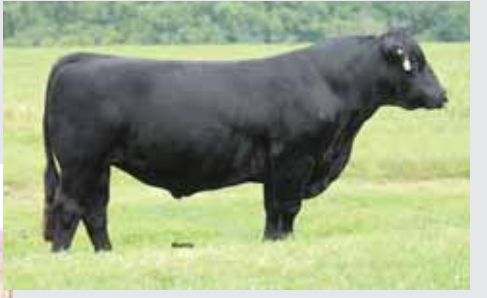
AGRI Chairman 1C