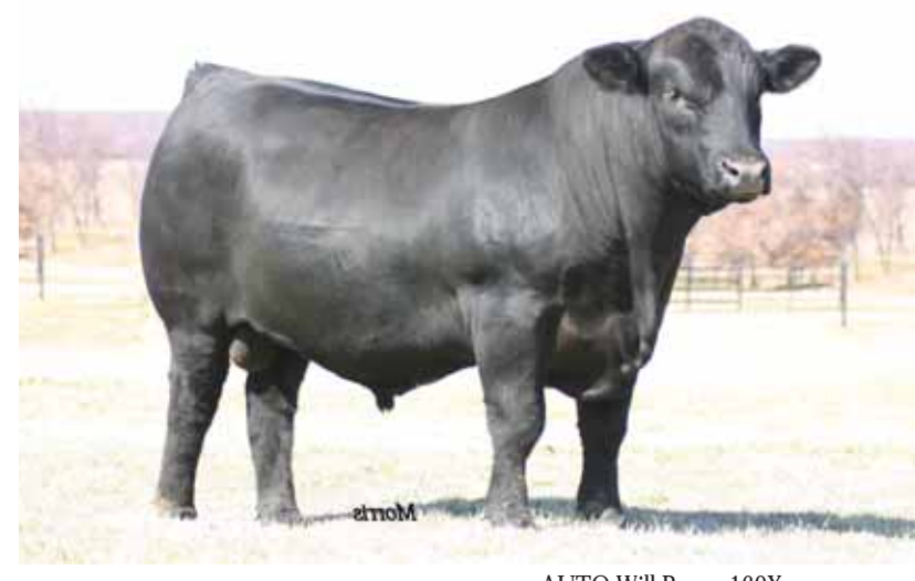
AUTO Will Power 160X,

Another direct daughter of AUTO Will Power, 50% Lim-flex female, double polled and black. She ranks in the top 4% of the population for MB, and the top 10% for $MTI. Her dam is a daughter of MAGS Xyloid. Solid cow prospect here!