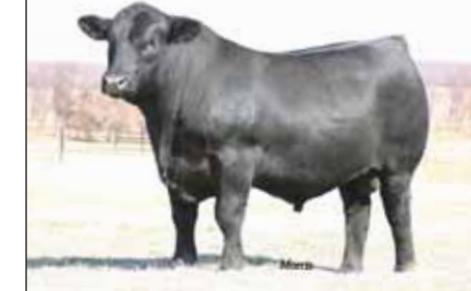
AUTO Will Power 160X, service sire to Lot 4.

If you like your females powerful, look at this double polled, homozygous black, MAGS Eagle daughter that ranks in the top 10% of the breed for the economically important traits of: WW,YW, CED and $MTI. Her dam's pedigree is second to none, combining MAGS Yip and SAV Bismark, these cattle will work in any scenarios.