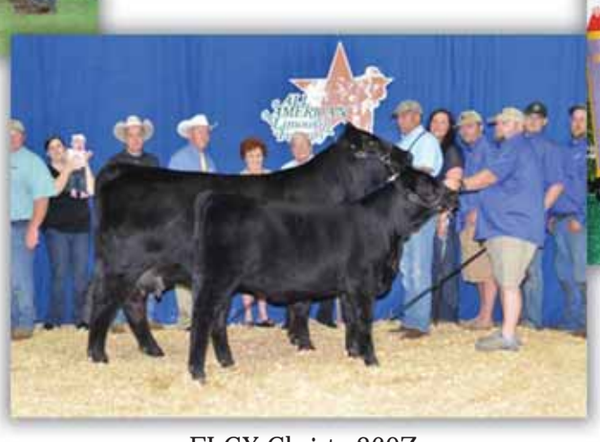
ELCX Christy 260Z

2014 Southeast Summer Classic Grand Champion Female 2015 All American Futurity Grand Champion Cow-Calf Pair Owned with Wies Limousin, Wellsville, MO