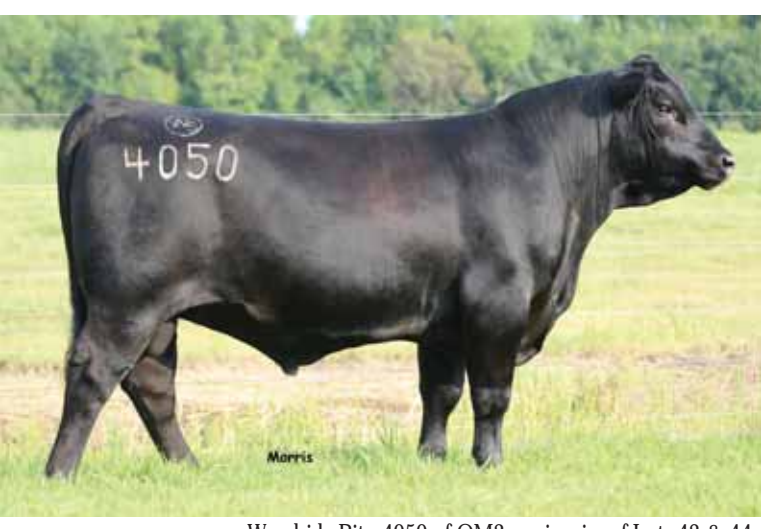
Woodside Rito 4050 of OM3 service sire of Lots 43 & 44.