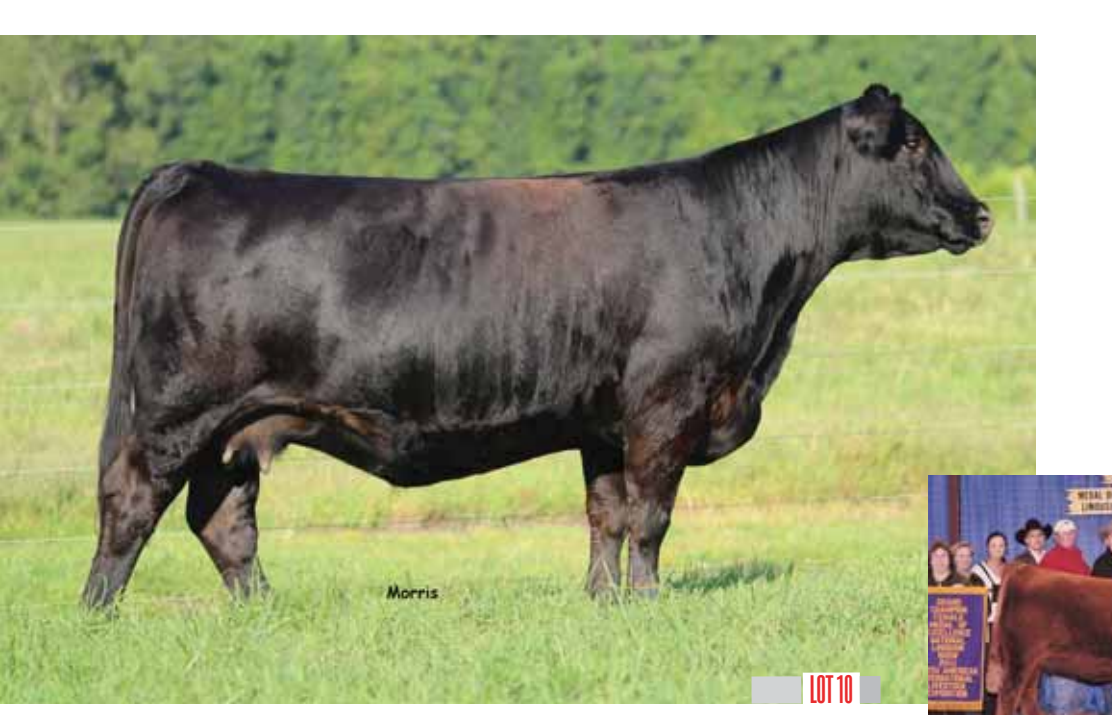
WLR Tainted Love, full sister to Lot 10.

PB Limousin (100) Cow HP / DB DBGR 222Z NPF 2028939 09.04.12