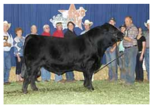
WLR Reload, sire of Lot 33 & 34.