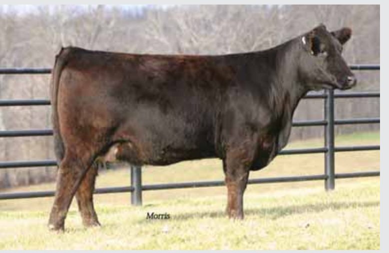
MINE PLD Net Worth 8043U. dam of Lot 88.

BW: 78 lbs.; WW: 625 lbs.; YW: 1,216 lbs.