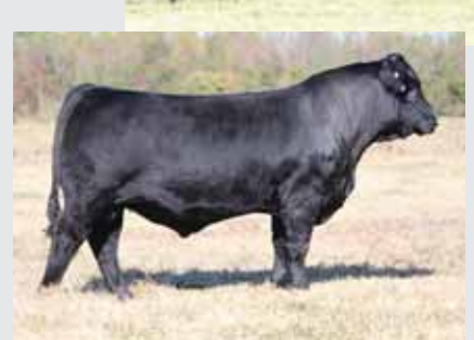
PBRS Add It Up 3120A