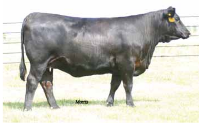
SBLX Utopian Queen 1305U, dam of Lot 29.