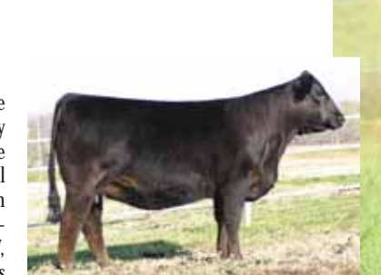
SBLX Underthecovers 201U, maternal grandam of Lot 8.