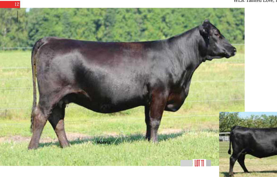
EXLR Barb 170R, dam of Lot 11.

LOT 11A - ELCX Emily 235E (LFF 2127878) - 50% Lim-Flex heifer calf born 09.16.17, DP/HB, sired by HBRL Genesis 404B.