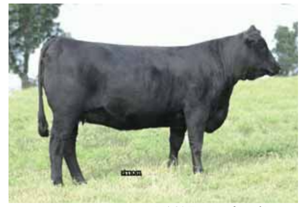
MAGS Tapestry, dam of Lot 63.