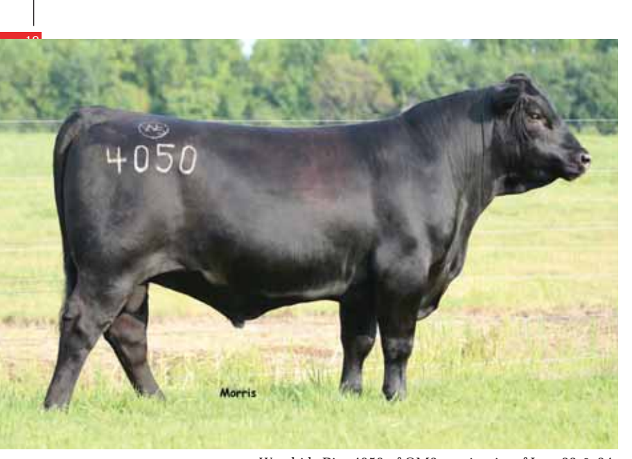
Woodside Rito 4050 of OM3, service sire of Lots 23 & 24.

GPFF BLAQUE RULON AMY JO DȟAN 20L EXLR NEW GENERATION 071M DAVIS ROSETTA 9514 JCL LODESTAR 27L VERMILION E BLACKBIRD9546 GPFF BLAQUE RULON ALCM KOOL TUNES