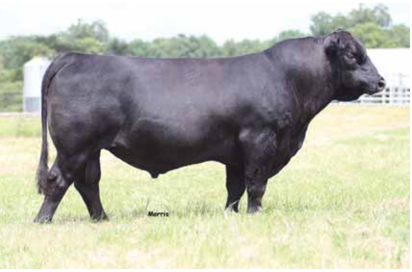
ELCX Postmaster, sire of Lot 26A and service sire of Lot 27.

This grandaughter of both DHVO Deuce and Bohi Rhonda 314R, also goes back to the famous EXLR Rebeca 1019P and stems from the famous EXLR Blackcap family. Blackcap and Express Ranches have been synonymous for success for more than 3 generations now. This 64% Lim-Flex female ranks among the top 20% for MB and top 25% for SMTI.