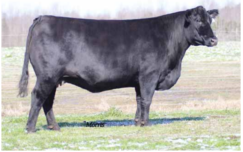
AUTO Sherri 227S, dam of Lot 36.

If you are looking for a red WLR Reload daughter her she is! Double Dee ranks in the top 10% of the breed for REA. This bred heifer will be a great addition to your replacement pen.