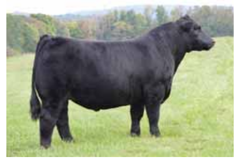
TMCK Architect 031A, sire of Lot 3A.