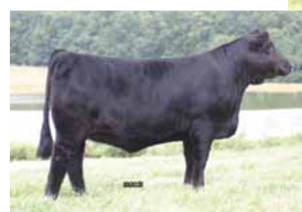
WLR Ugly Betty 432U, dam of Lot 12.

She is a daughter of MAGS Xukalani 691X,\, the \, leading \, 25\% Lim-Flex homozygous black son of Rito 1I2 of 2536 and from the Basin Franchise daughter out of the once national champion Carrousels Pina Colada Her dam is WLR Ugly Betty 532U, the proven donor and daughter of MAGS Shyllo from the elite red and polled donor JCL Heidi 2S. Ås a calf and now as a mature female, we admire her length and her stylish look.