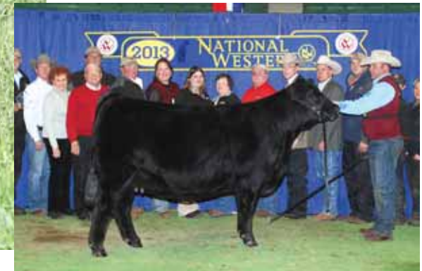
Dam, ELCX Twilight 114X

Lim-Flex (43) Cow HP / HB ELCX 752E LFF 2140180 10.02.17