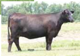
Dam, EBFL San Jose 170X