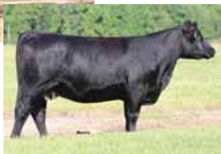
Dam, PBRS Audrey 346A