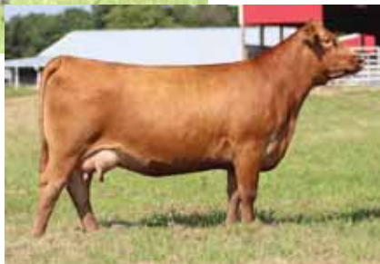
Dam of Lot 87, SBLX Zane

PE. 5.09.19 to 8.09.19 to Riverstone Exodus (CPM 4088530) (H/H PB)