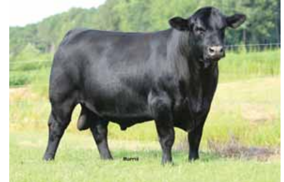
ELCX Benchwarmer 363B