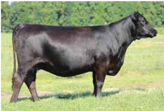
Dam of Lot 22, AUTO Barbie 235Z

Lim-Flex (31) Cow HP / HB ELCX 520E LFF 2141007 10.09.17