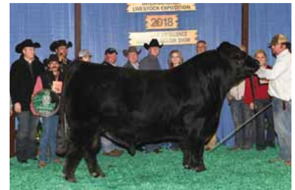
ELCX Kings Landing 599D