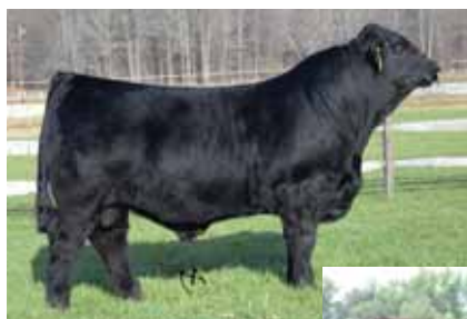
Sire, TMCK Cash Flow 247C