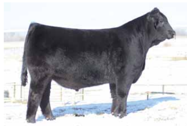
Sire of Lots 23 - 25, MAGS Aviator

P.E. 11.23.18 to 2.05.19 to Riverstone Exodus (CPM 4088530) (H/H PB); P.E. 3.20.19 to 8.15.19 to ELCX Benchwarmer 363D (LFM 2059017) (H/H 25%)