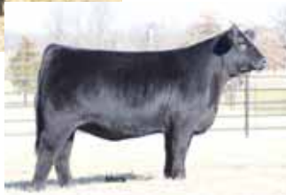
Dam, AUTO Poem 273Y