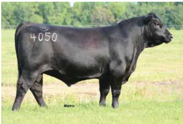
Sire of Lots 57 - 59, Woodside Rito 4050 of OM3