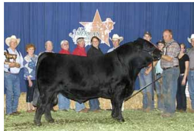
Sire of Lot 76, WLR Reload

You are going to love this brood cow. ELCX Cinderella 072C is a double black, double polled daughter of WLR Reload. She ranks in the top 20% of the breed for weaning and yearling weight EPDs. This female's dam, EXLR Jezabel 072W is an EXAR Prime Premium 6444 daughter. We love how sound made this one is- she's big boned and crazy appealing in her design. She's deep bodied and full of functional potential.