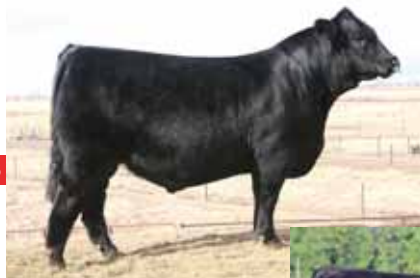
Sire, MAGS Wazowski