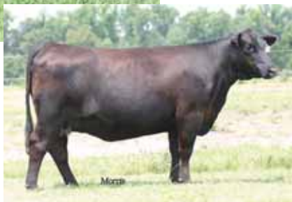
Dam of Lot 86, EBFL San Jose 170X