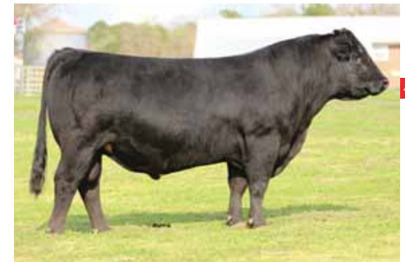
ELCX Caesar 331C