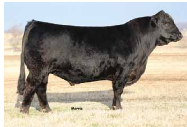
Sire of Lots 41 - 43, MAGS Zodiac,

P.E. 11.29.18 to 2.18.19 to ELCX Campfire 508C (LFM 2095839) (P/HB 50%); P.E. 3.01.19 to 8.09.19 to ELCX Ethan 718E (LFM 2135456) (HP/B 25%)