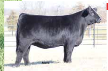
Dam, AUTO Poem 273Y

Lim-Flex (50) Bull HP / Red ELCX 769E LFM 214148 12.20.17