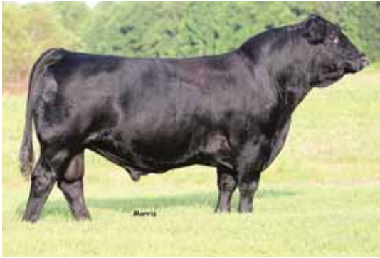
Sire of Lots 16 - 22, WLR Game of Thrones