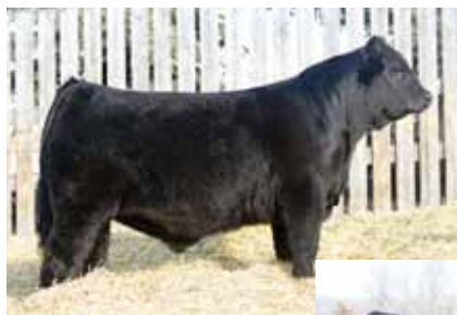
Sire, Riverstone Crown Royal