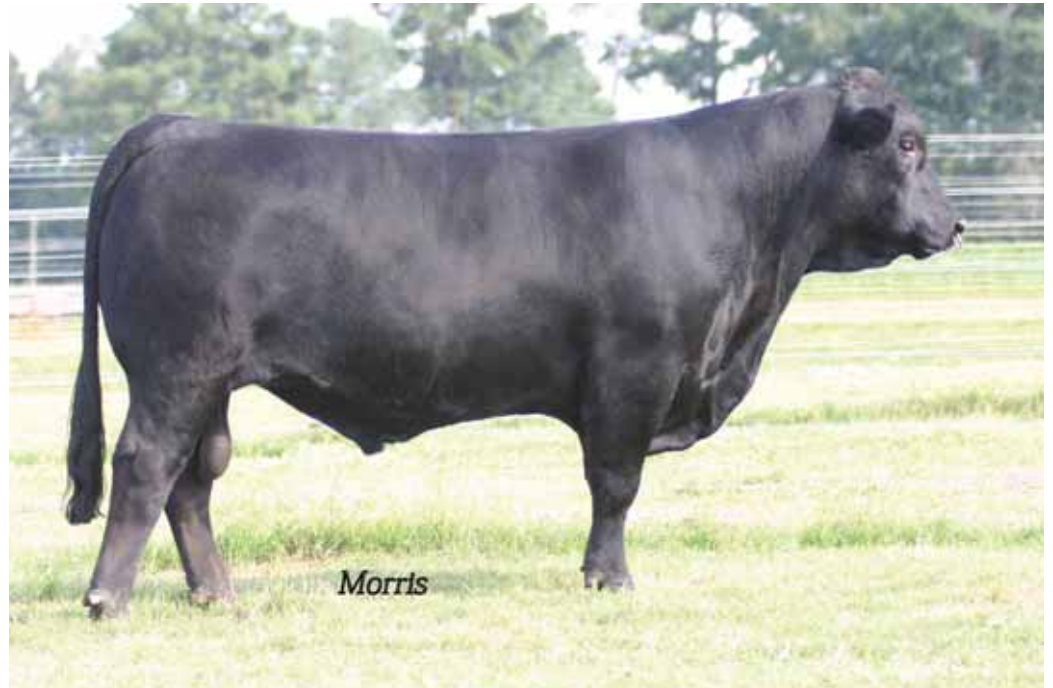
TW Fire N' Ic 105X, service sire to Lots 44 - 46.