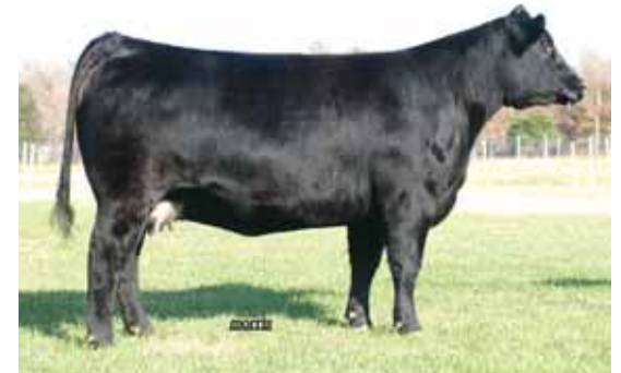
AUTO Rain 220R, dam of Lot 86, selling as Lot 9.