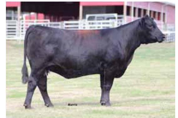
AUTO Emma 621X, dam of Lot 87, selling as Lot 22.