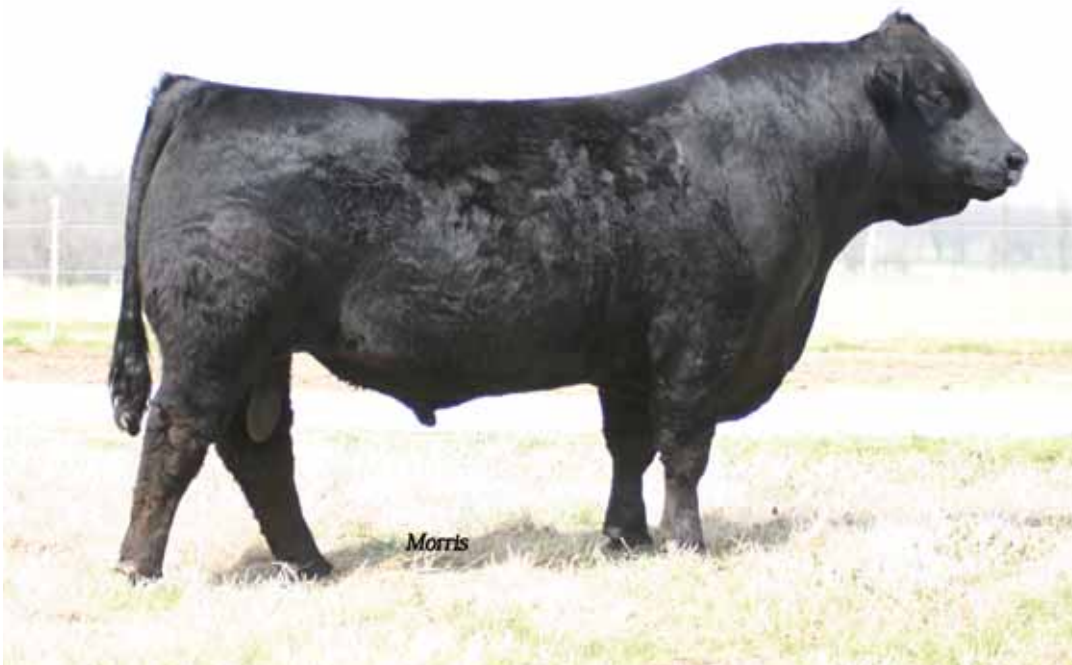
BOHI Top Dollar 7144T, sire to Lot 9A embryos.