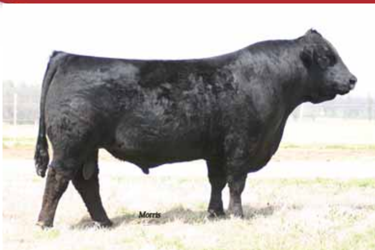
BOHI Top Dollar 7144T