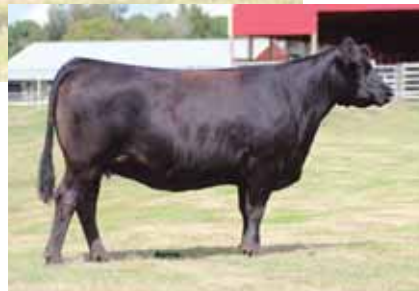
ELCX Winners Circle 120W, dam of Lot 82