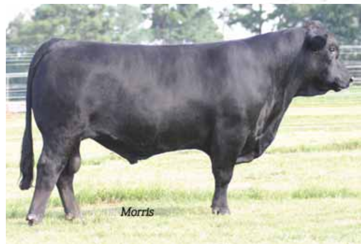
TW Fire N' Ice