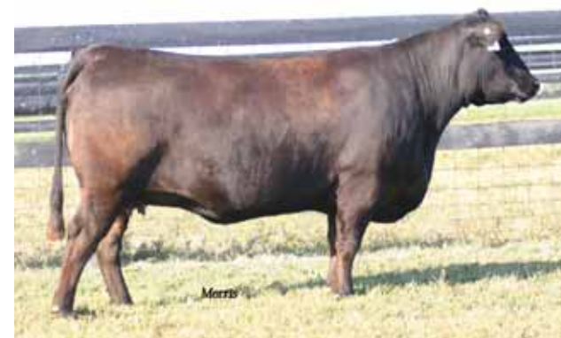
SSTO Sadie 6854S, dam to Lot 74.