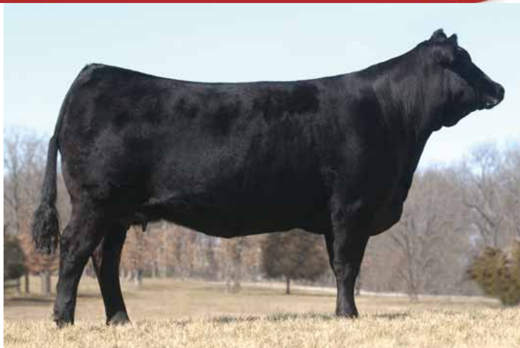
AUTO Elite 270F, dam of Lot 49.