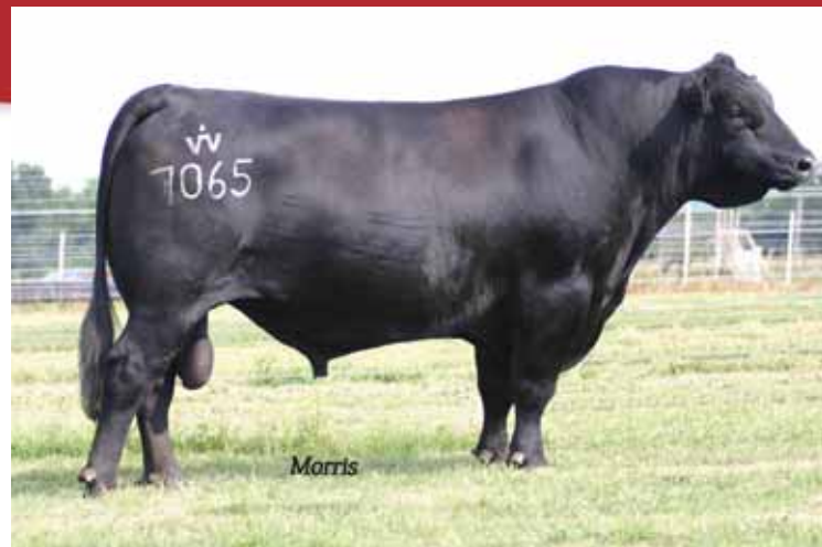
RITO 7065 of Rita 5M46