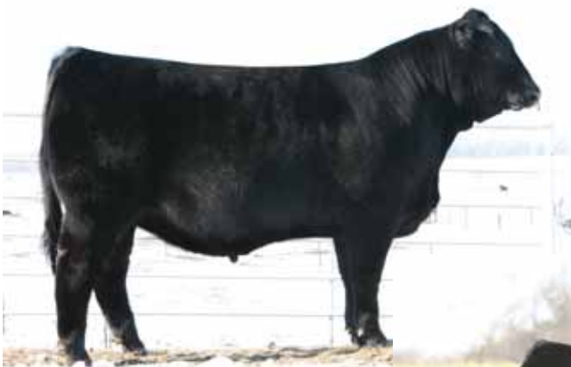
MAGS Winston, sire to Lot 5A embryos.