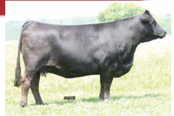
NICO Polled Frosty, dam of Lots 83, 84 & 85, selling as Lot 11.