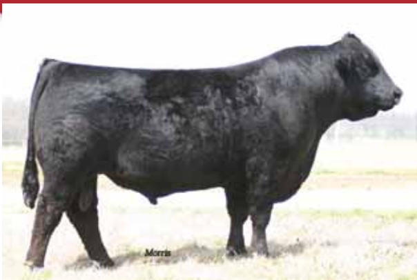
BOHI Top Dollar 7144T, service sire to Lot 58.

A family operation with the integrity and values needed to gain your respect!