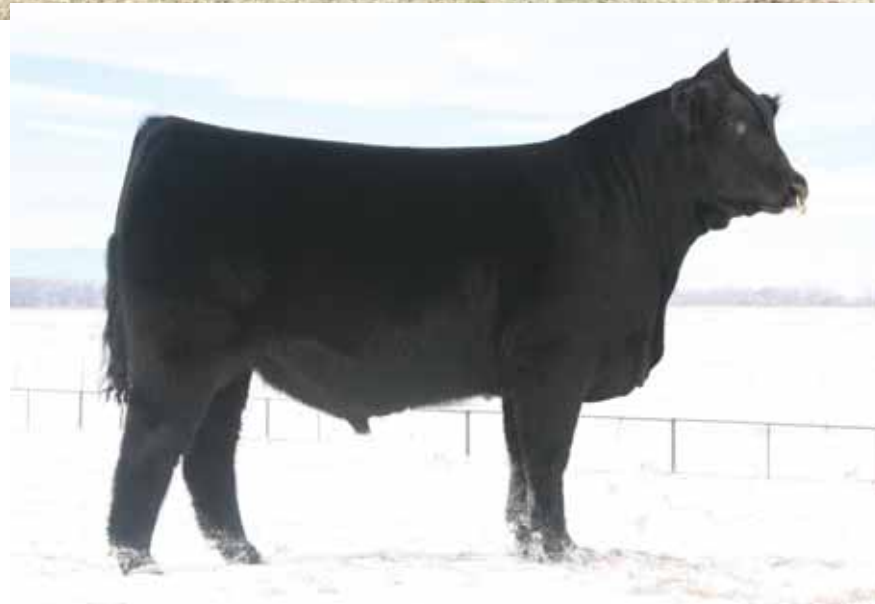
MAGS Xyloid, sire to Lot 6A embryos.

A family operation with the integrity and values needed to gain your respect!