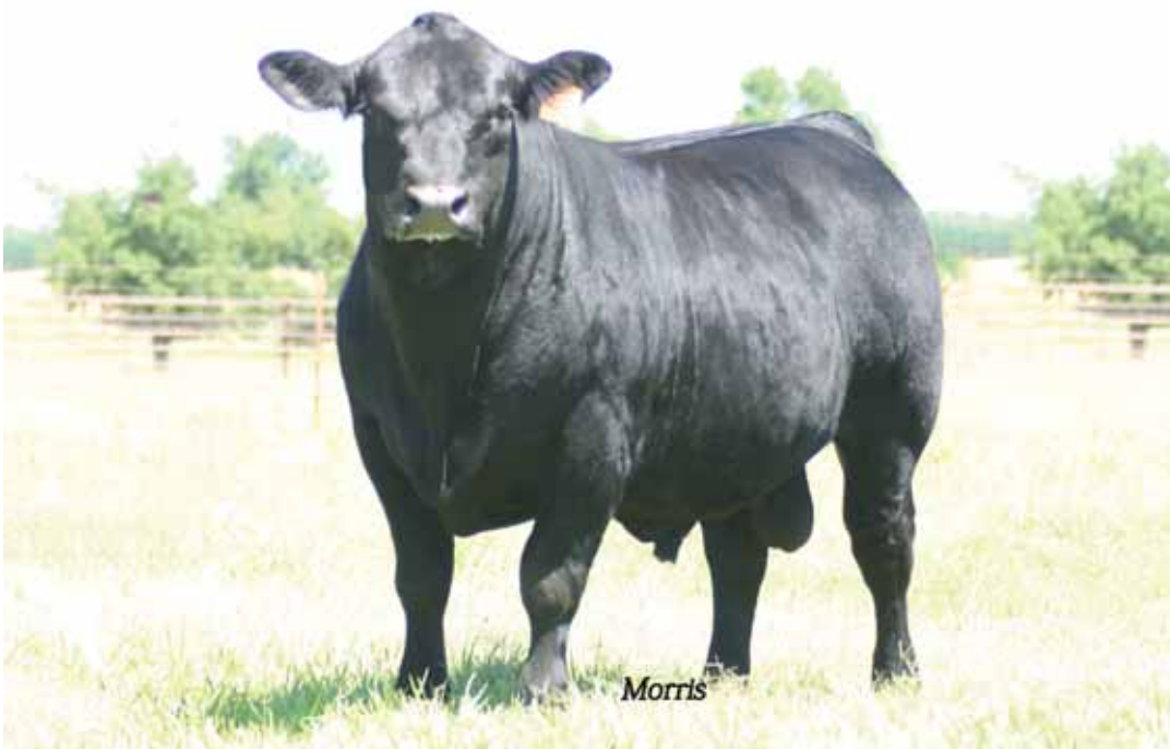
EBFL Ypsilanti 420Y, sire of Lot 3A embryos.