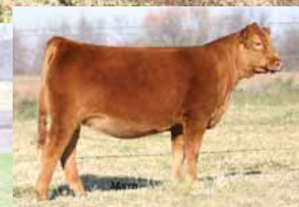
ELCX Under Cover 201Y, son of Lot A.