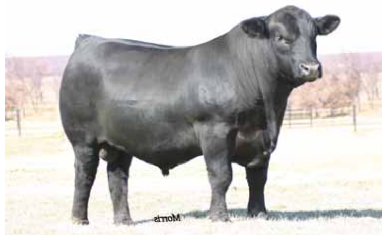
AUTO Will Power 160X