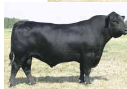
Mytty In Focus, sire of Lot 2B embryos.