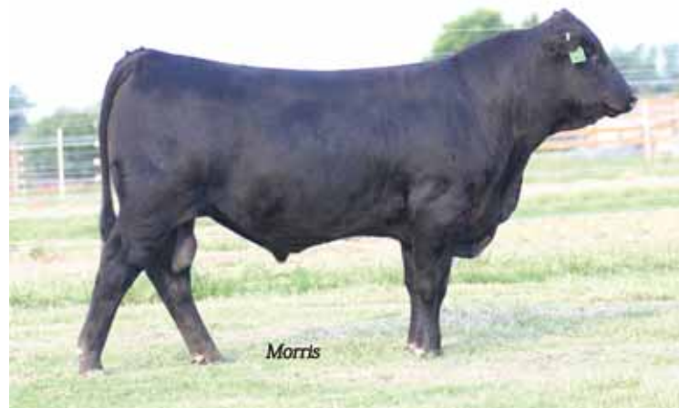
ELCX Postmaster 208Y