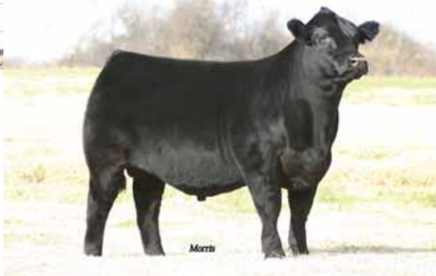
CALO Brickyard 902W, sire to Lot 5B embryos.