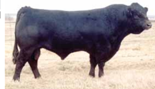
JCL Lodestar 27L, sire fo Lots 61 - 63.

BW: 85 lbs.; WW: 670 lbs.; YW: 1,122 lbs. 75% Lim-Flex, polled and homozygous black