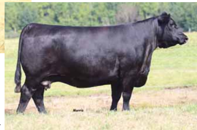
SBLX Unknown 104U, dam of Lots 8, 9 & 10.