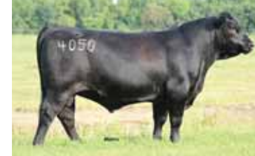
Woodside Rito 4050 of OM3