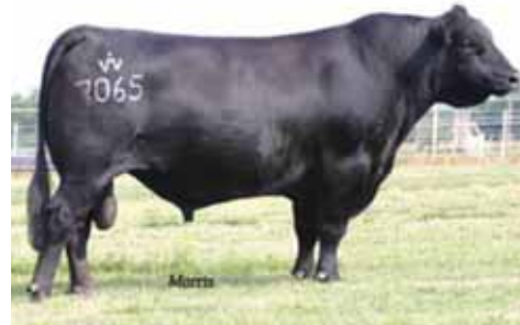
RITO 7065 of RITA 5M46, service sire to Lot 57.