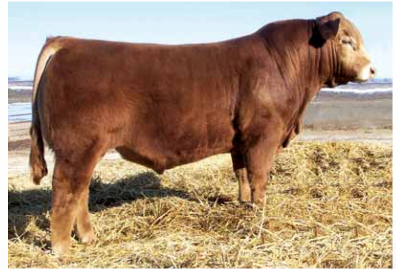
Wulfs Xcellsior X252X, sire of Lot 31.

She sells bred to the big numbered purebred Angus sire Woodside Rito 4050 of OM3