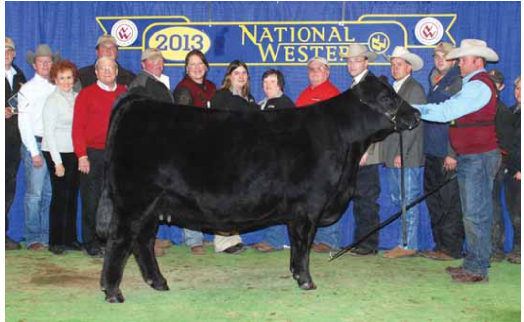
ELCX Twilight, the 2013 National Champion Female and maternal sid to Lots 13 & 14.

These future calves will be very exciting to see at weaning time when they will be ready to hit showbarn or the market place. Sired by the national champion bull EF Xcessive Force and leading sire for Linhart Limousin, Thomas & Son and Etherton Farms. From the big league Edwards donor DFLC 1S, the dam of the 2013 National Champion Limousin Female, ELCX Twilight.