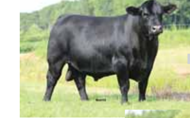
ELCX Benchwarmer 363B