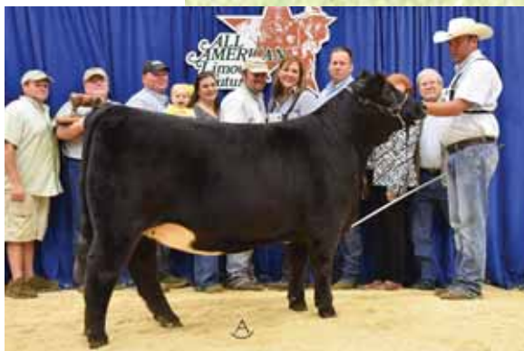
ELCX Candy 330C, 2016 All-American Futurity Supreme Champion Female, and 3/4 sib to Lot 1A.