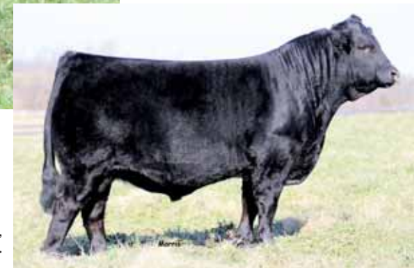
ENGD Zip Line 2515Z, sire of Lot 14.