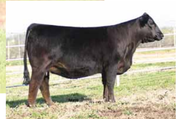
SBLX Underthecovers 201U, dam of Lot 6.

Lim-Flex (50) Cow DP / DB SBLX 201X LFF 1954700 05.02.10