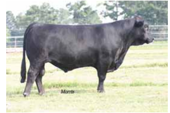
TW Fire N Ice, sire of Lots 32 - 34.

TW Fire N' Ice is the once reserve national champion Lim-Flex sire and now leading sire for the Edwards Land & Cattle Co. program. He is a son of BOHI Titelist 7050T which is a son of AUTO Dollar General 122R from the once national champion female Carrousel's Pina Colada. He is from a very big numbered donor MAGS Upper Saunter that still resides in the ELCX program. The TW Fire N Ice progeny have been very well received in our breed for the extreme numbers and their excellent structure. We think you will be pleased after evaluating these three daughters listed below - Lots 32, 33 and 34.