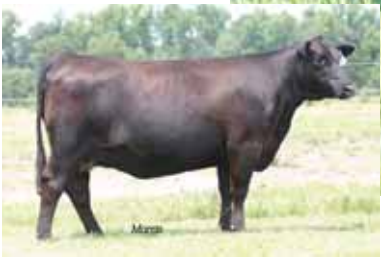
EBFL San Jose 170X, dam of Lot 3.

BW: 78 lbs.; WW: 682 lbs.; YW: 1,194 lbs.