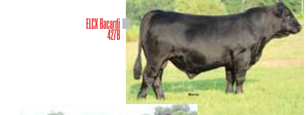
ELCX Bacardi 427B