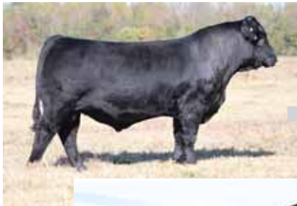
PBRS Add It Up 3120

WULFS TITUS 2149T MAGS SNICKERS DR J ANALYST M250 MAGS PHANTOMS PRIZE