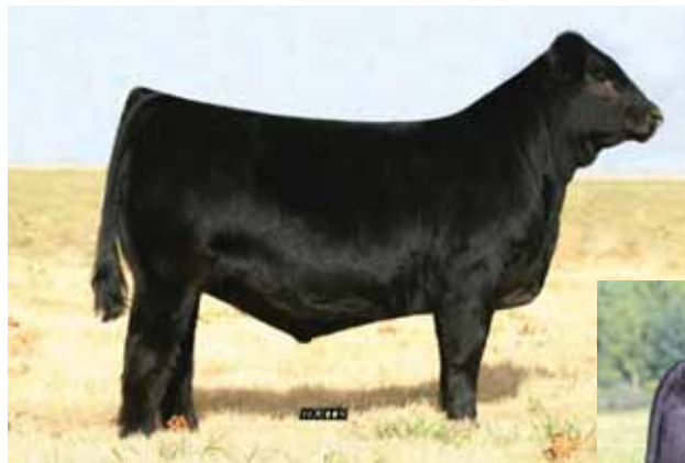
CFLX Wild Card, sire of Lot 10.

P.E. 12.7.15 to 6.1.16 to TW Fire N' Ice 75% Lim-Flex, double polled and double black Here is another known daughter of the famed SBLX 201U She is sired by the once national top selling herd sire CFLX Wild Card. He is the leading son of the once national champion sire DHVO Deuce 132R and from the famed JCL Peppermint. He is a full sibling in blood to the $40,000 valued donor CFLX Molly's Image that is now working for Linhart Limousin, Leon, IA