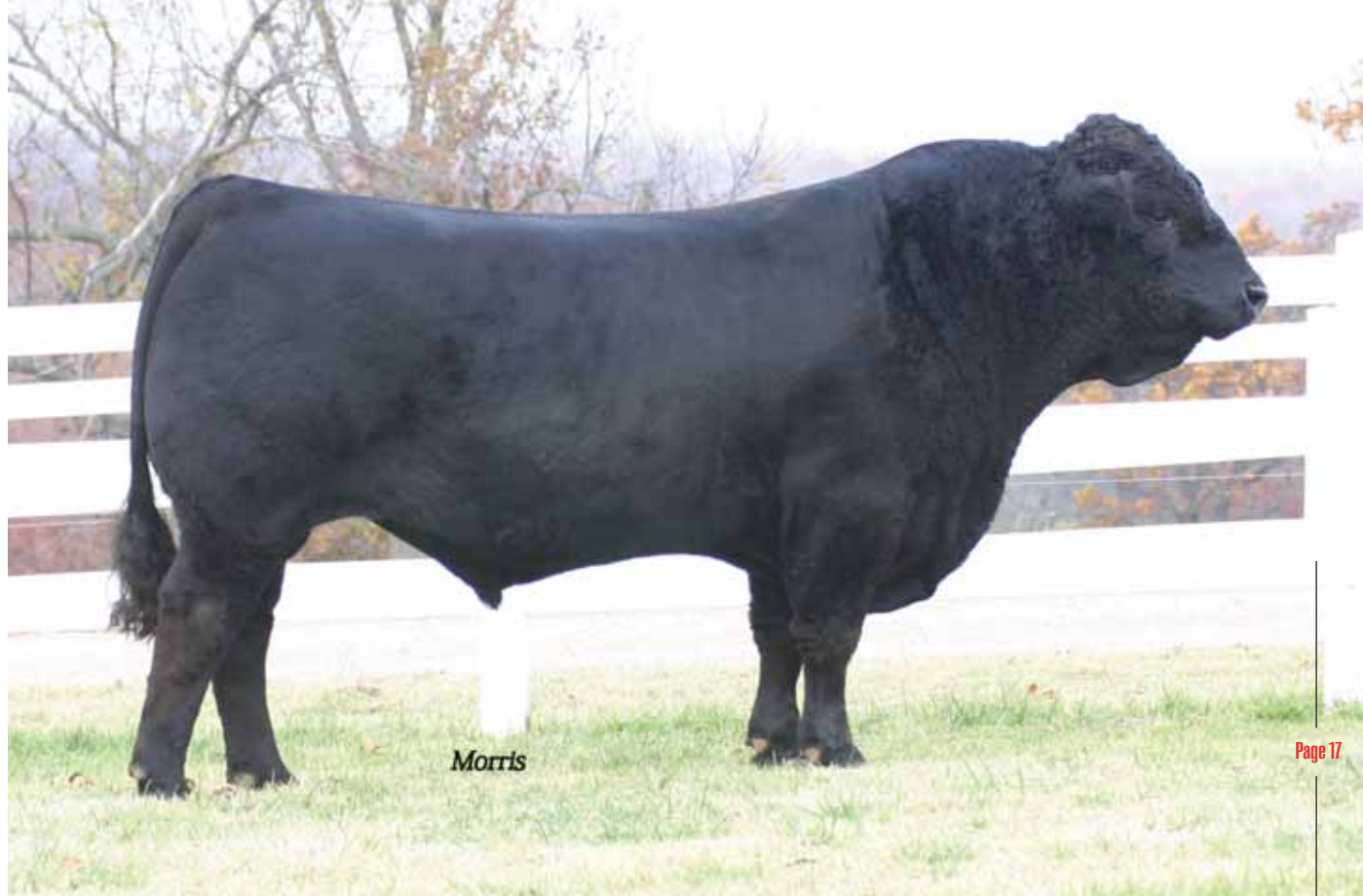
BOHI Top Dollar 7144T, sire of Lots 17 - 20.

Here are four daughters of BOHI Top Dollar 7144T, the son of AUTO Dollar General 122R and from the national champion female Carrousel's Pina Colada. AUTO Dollar General 122R is one of the breed's leading EPD sires of all time and now makes his home at GV Limousin, Garnett, KS. Carrousel's Pina Colada is the leading donor for P Bar S Ranch, Sand Springs, Ok and Edwards Limousin, Higginsville, MO. She is recognized as one of the finest and most prominent donor cows of all time. The genetics and performance of BOHI Top Dollar 7144T has been positively influenced in the ELCX program over the last few years and these young daughters are proud representatives of him.