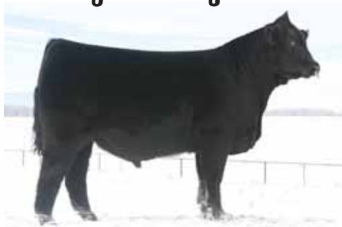
MAGS Xyloid, sire of Lots 21 & 22.