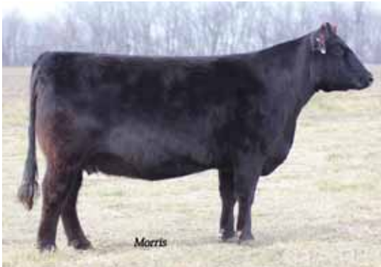
PBRS Trouble 127T, dam of Lot 74.

Lim-Flex (62) Bull DP/HB ELCX 425B LFM 2074234 10.04.14