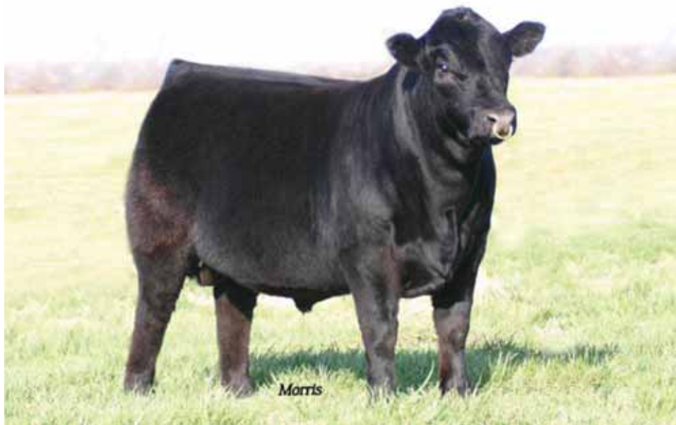
TW Fire N' Ice, sire of Lot 54A.

PB Limousin (100) Cow DP/DB DPBN 6W NPF 1951178 10.05.09