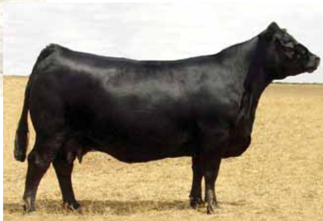
LFL Upper Crust 0090 X, dam of Lot 12 embryos.