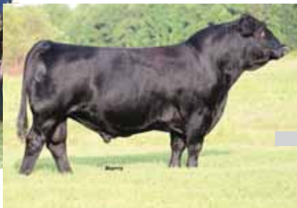
WLR Game of Thrones