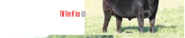
TW Fire N' Ice