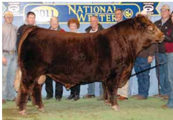
MAGS WL Usual Suspect 538U, sire of Lot 29.

Her dam is a daughter of MAGS Winston, the now deceased but very popular A.I. sire in the breed