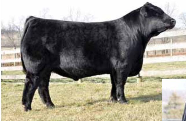
EF Xcessive Force, sire of Lot 11 embryos.