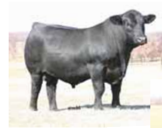
AUTO Will Power 160X