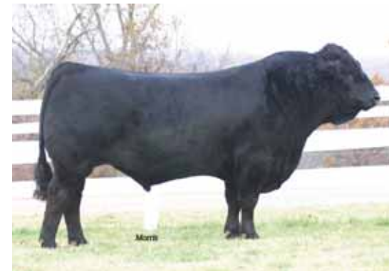
BOHI Top Dollar 7144T, sire of Lot 60.

Lim-Flex (75) Bull HP / HB ELCX 505C LFM 2095837 02.20.15