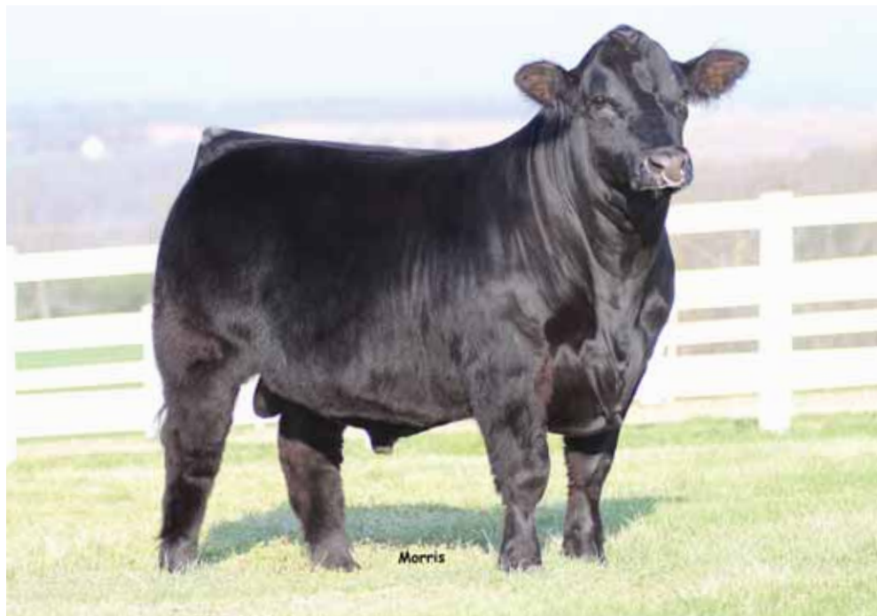
ELCX Turning Point 641 Z, sire of Lot 66..

By selecting ELCX Crank 207C you will add pounds, performance and a prominent look to a set of calves if you consider this young bull.