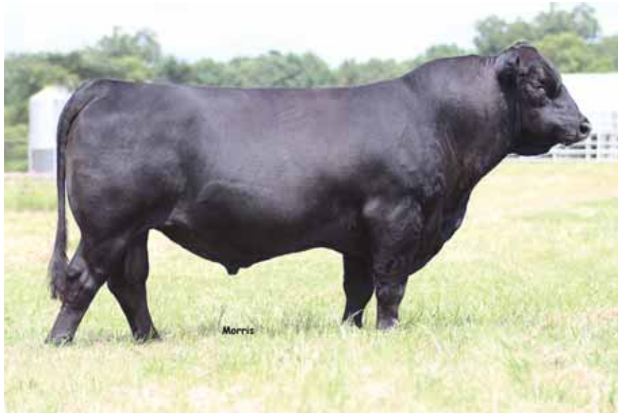
ELCX Postmaster 208Y, service sire of Lot 48.

Lim-Flex (50) Cow HP/HB ELCX 307Z LFF 2031147 11.06.12