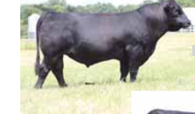
ELCX Postmaster 208Y