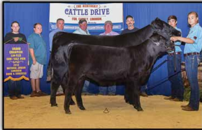
ELCX Aaliyah 453A