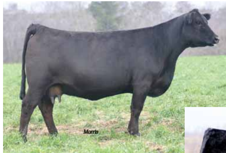
DFLC HBHPC 1S, dam of Lot 13 & 14 embryos.

These future calves are purebred and double homozygous Sired by ENGD Zip Line, the leading purebred and many times show champion bull From DFLC 1S, the leading donor and dam of the 2013 National champion Female, ELCX Twilight These future calves will instantly have the notoriety and promotion needed to get attention for your program