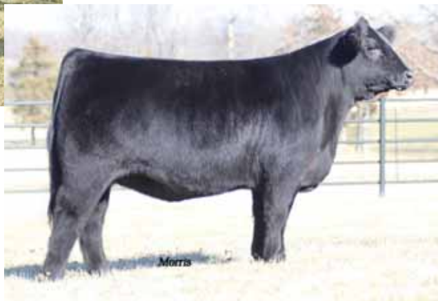
AUTO Poem 273Y, dam of Lot 11 embryos.