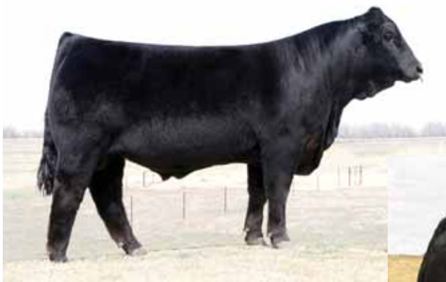
MAGS Yip, sire of Lot 12 embryos.