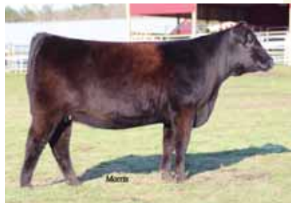
ELCX Edith Erica 128Y, dam of Lot 21