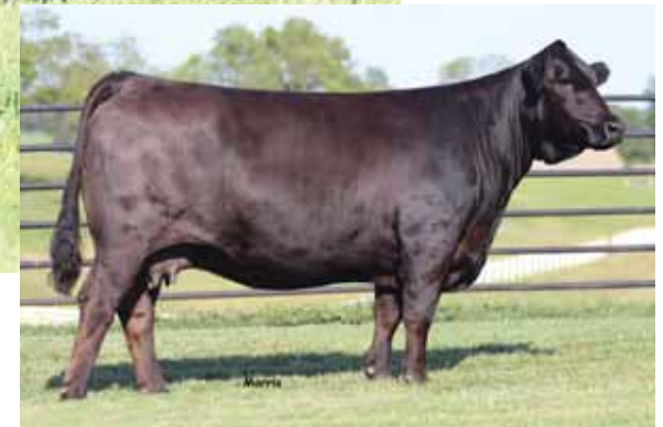
MAGS Manuela, maternal grandam of Lot 4.

PB Limousin (100) Cow DP / DB OMEG 041Y NPF 1996482 04.20.11