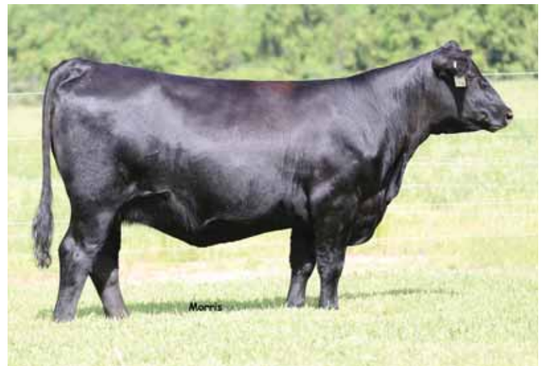
EXAR Forever lady 82079, dam of Lot 27.

This female was created by blending the best in purebred Limousin with the best in purebred Angus. She is sired by Wulf's Warrior and from a daughter of Basin Franchise