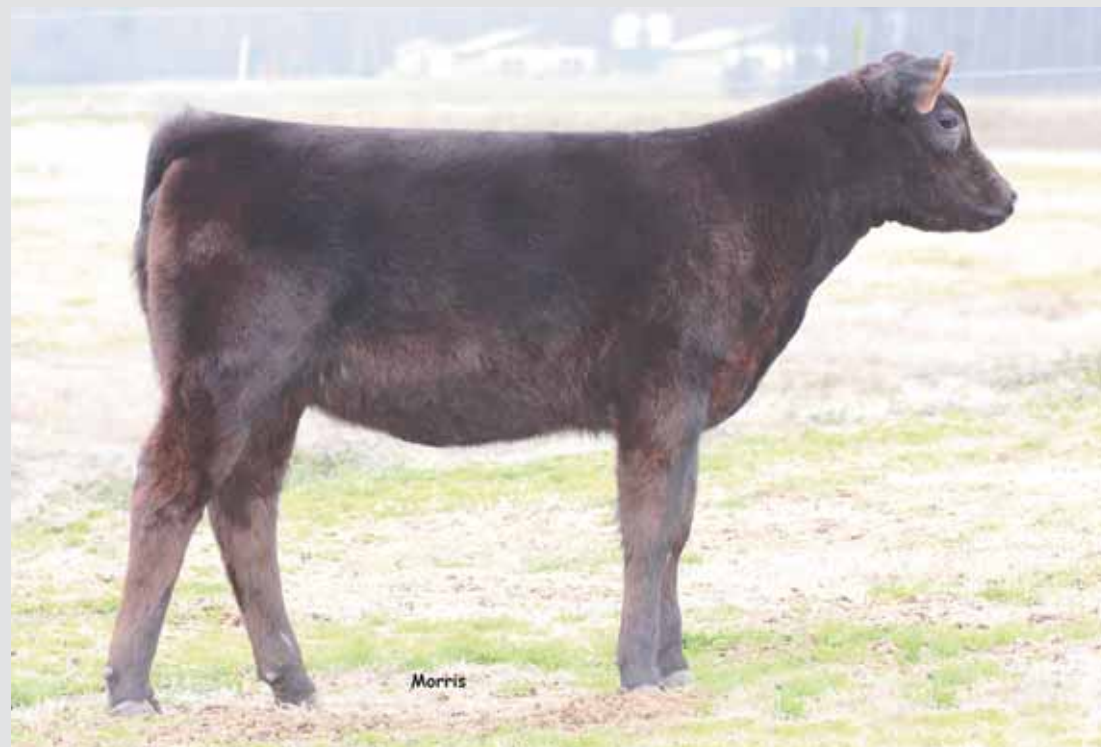
Lot 20 > PVC STAR- BUCKS A356