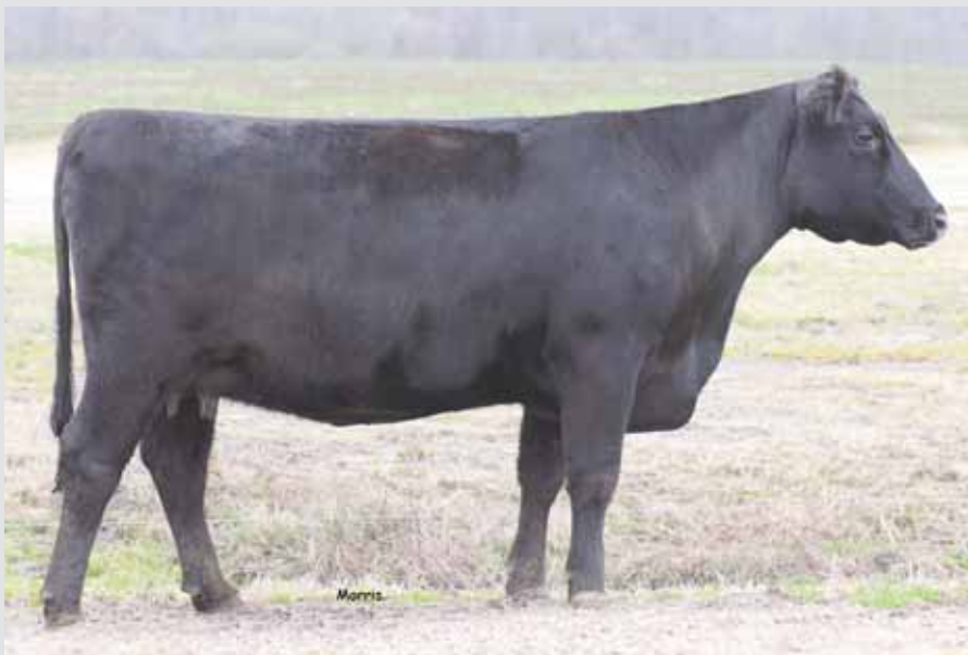
Lot 34 > RITA 9MA1 OF RIT 7O67 PRED