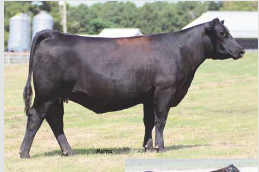
Lot 32 > TW DELIGHT 2920Y