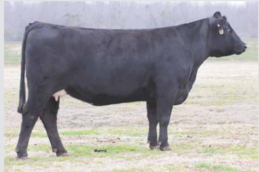
Lot 33 > YRTX WHIRLWIND 906W