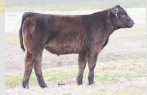
Lot 32A > ELCX ORINAL 920A