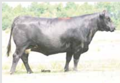
DAM, MAGS SATCHEL