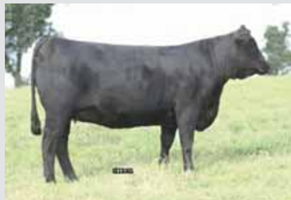
DAM, MAGS TAPESTRY