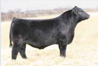
SIRE, EXAR UPSHOT 0562B