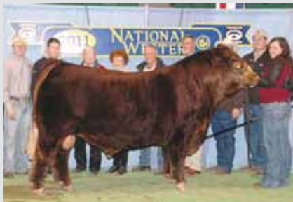
SIRE, MAGS USUAL SUSPECT