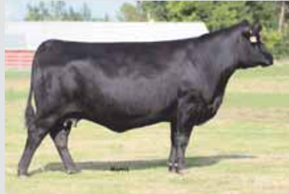
DAM, PAF 1160 MIDLAND 330