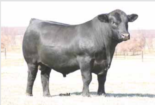
REFERENCE > AUTO WILL POWER 160X