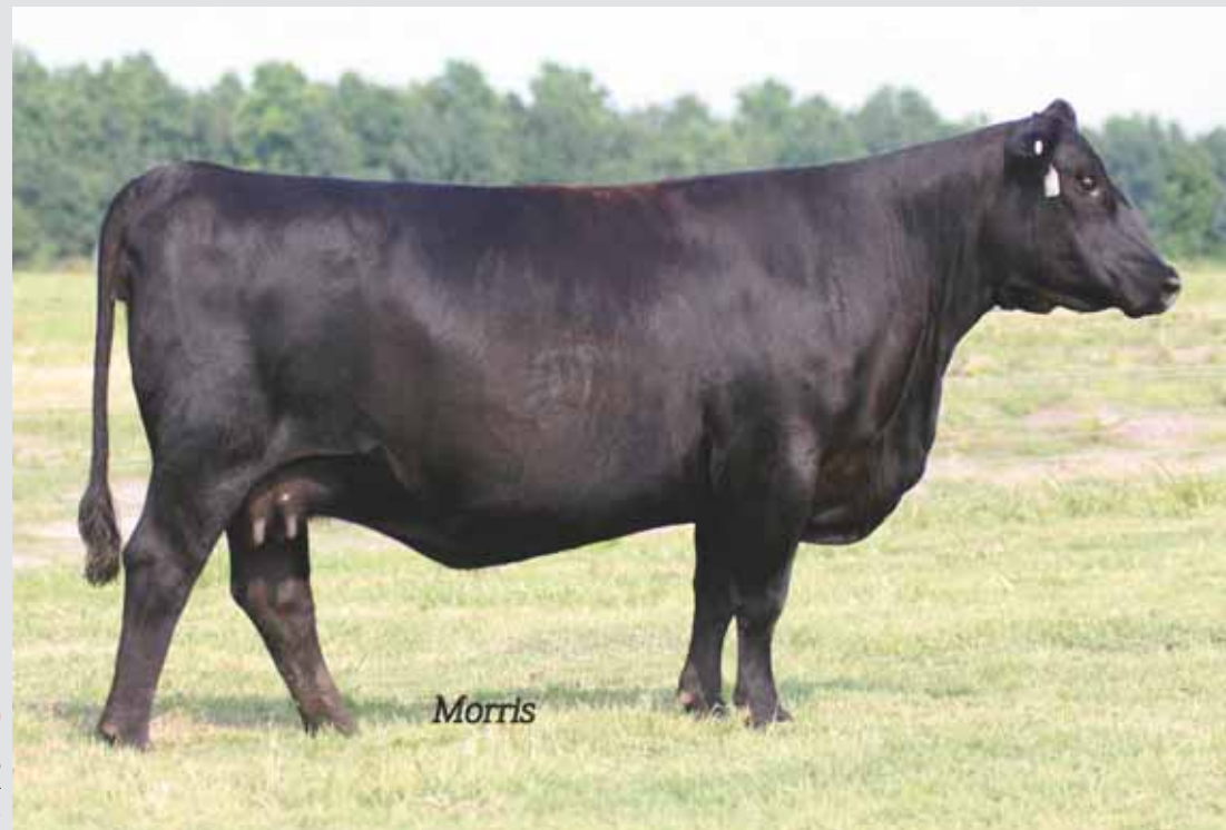
Lot 20 Reference> SBP PHANTASY 6207