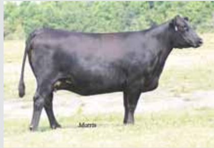
DAM, SHAMROCKS JULIA 014P