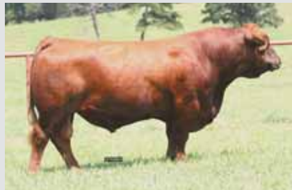
SIRE, EXLR REVIEW 753R