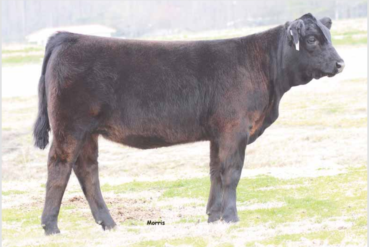
Lot 4> ELCX ARENA 14A