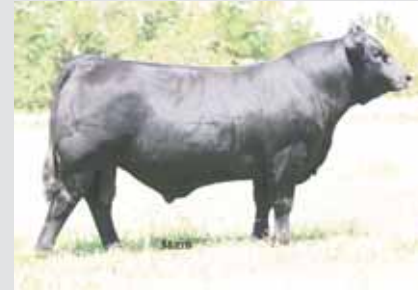
SIRE, EBFL YPSILANTI 420Y