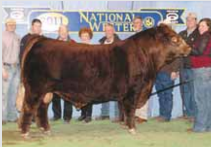
Sire > MAGS WL Usual Suspect 538