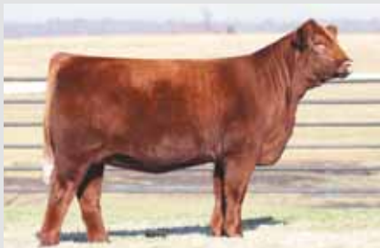
AUTO RED ROSE, FULL SIB TO LOT 21 EMBRYOS.