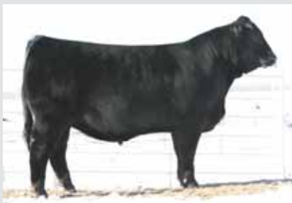
SIRE, MAGS WINSTON