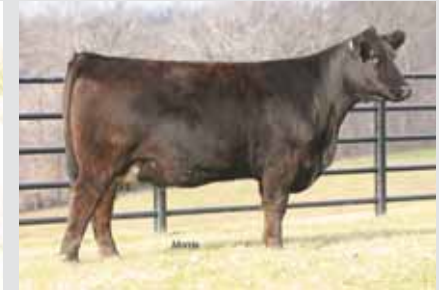
DAM, MINE PLD NET WORTH 8043U