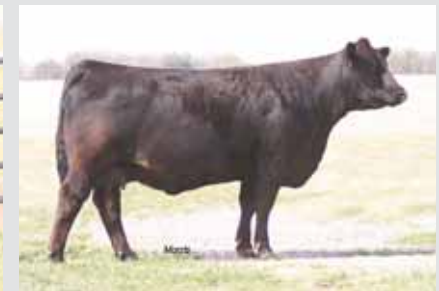
DAM, MAGS SARAFINA