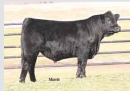
SIRE, AUTO GUNN POINT 192Y