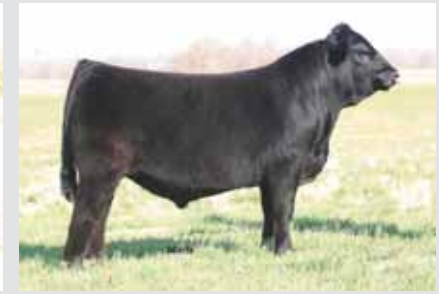
SON, TW FIRE N ICE