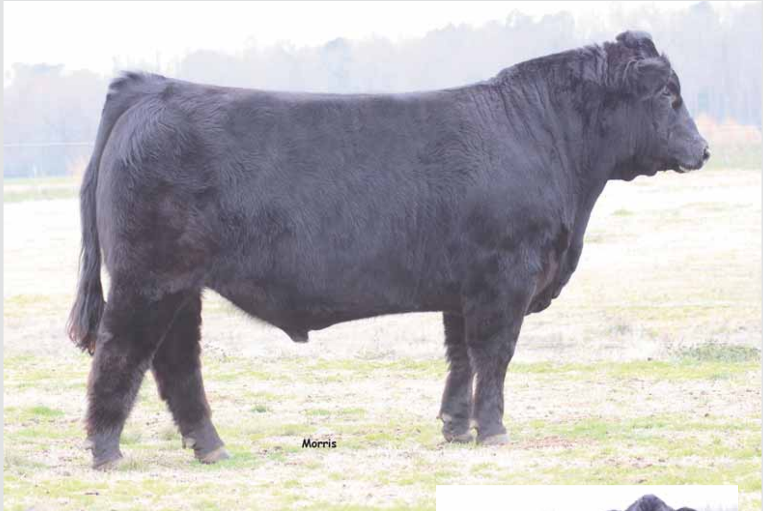
Lot 59> ELCX STAR STRUCK 641Z