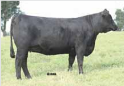
Dam > MAGS TAPESTRY