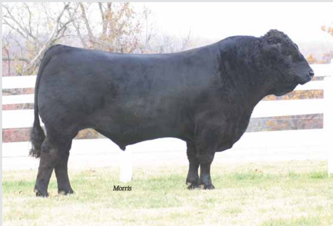
Lot 70 Reference Sire> BOHI TOP DOLLAR 7144T

A family operation with the integrity and values needed to gain your respect!