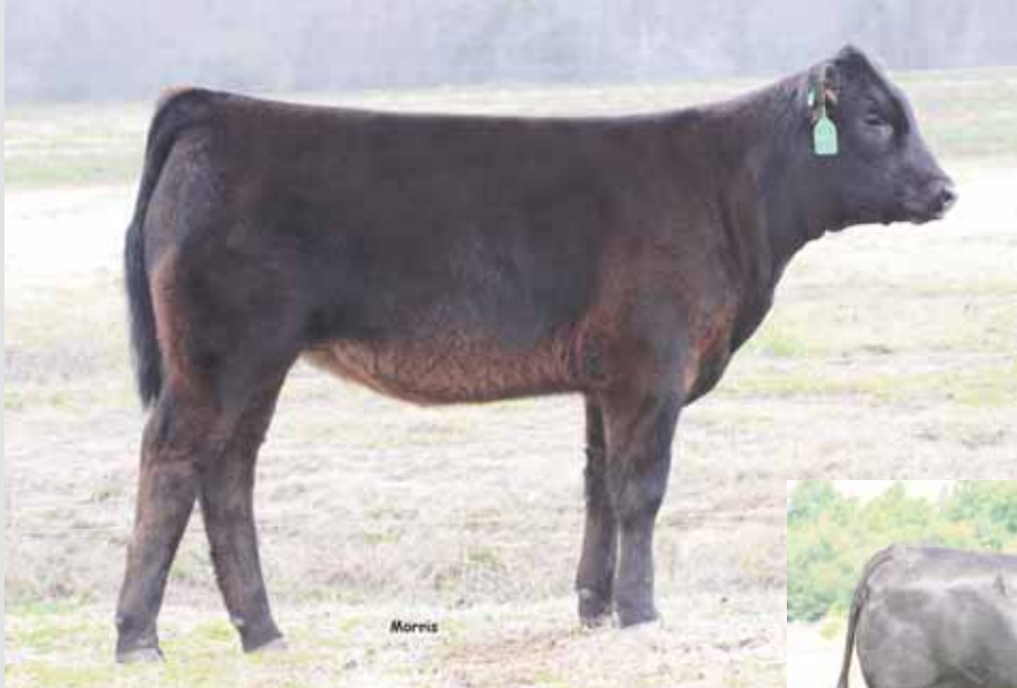
Lot 3 > ELCX AMERICA 353A