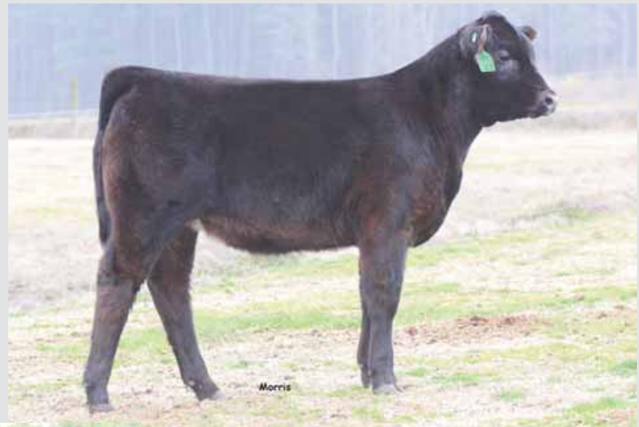
Lot 2 > ELCX AMANDA 354A